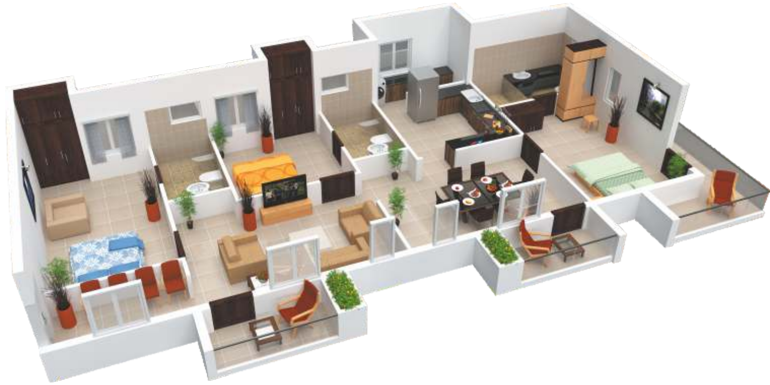
Area : 2,035 Sq.ft Flat No : 1B, 2B, 3B & 4B