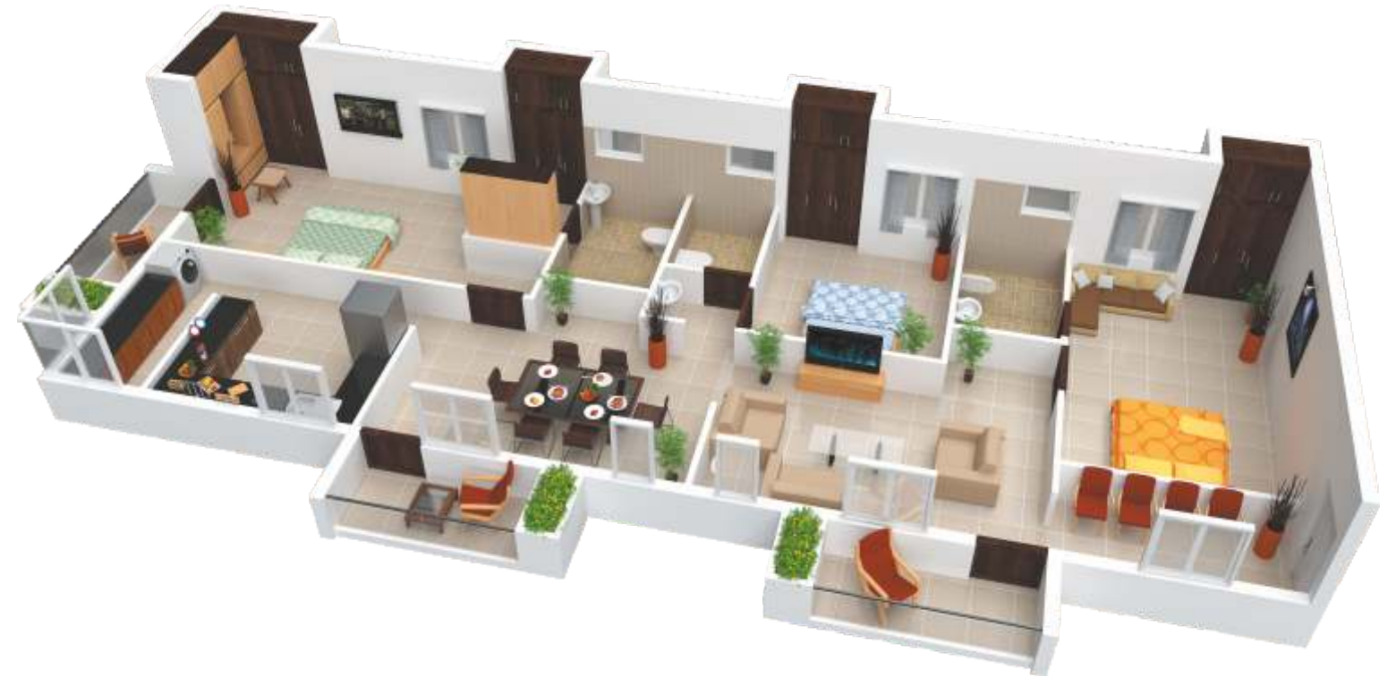
Area : 2,170 Sq.ft Flat No : 1A, 2A, 3A & 4A